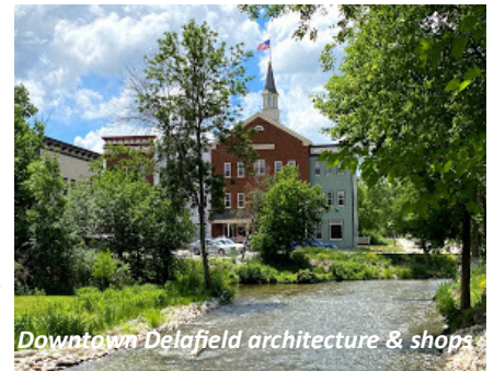
Downtown Delafield architecture & shops

and managed Restaurant/Breweries located off Highway 83 in Delafield, where more specialty and national chain shopping and restaurant choices can be found.