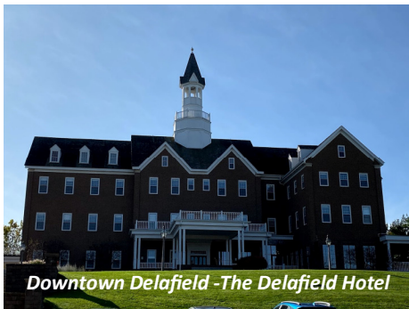
Downtown Delafield -The Delafield Hotel