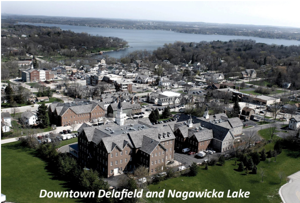
Downtown Delafield and Nagawicka Lake

Delafield, Wisconsin is the your “closer to home” family getaway destination, located off I-94 at Exits 285 & 287, between Milwaukee and Madison. Once you check in and unpack, you can begin to unwind in a beautiful location full of inter-connected hike & bike trails, parks, forests, lakes, rivers and wide open spaces to discover. This outdoor enthusiasts destination is here for you when you are ready for a Road Trip! Book your stay, pack the car, and visit Delafield, Wisconsin! https://www.visitdelafield.org/lodging