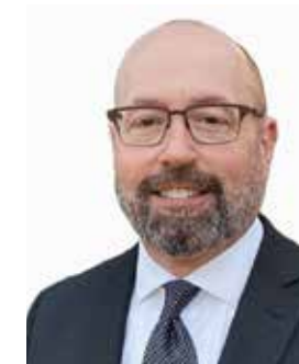
Mayor Tim Aicher